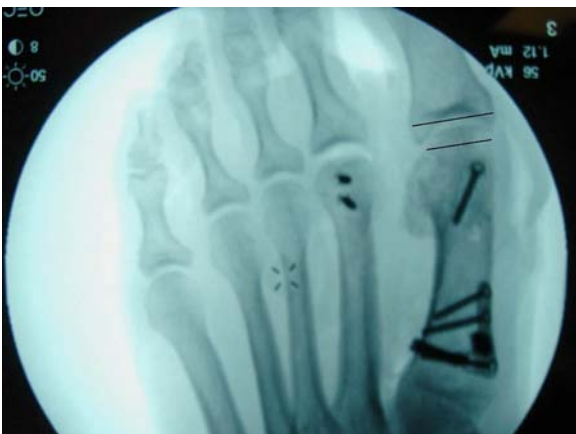
FIGURE 7. Radiograph shows reduction of the distal metatarsal articular angle using a biplanar chevron osteotomy.

Physical examination in the office should include an assessment of the patient’s gait, looking for associated hindfoot deformities such as flatfoot and forefoot deformities including pronation of the great-toe and lesser-toe deformities. This is followed by inspection of the foot, with attention to the plantar aspect of the lesser MTP joints. Calluses and pain to palpation underlying this area may be an indication of pathology, which may need to be addressed concomitantly with the bunion procedure. On occasion, this metatarsalgia may be the patient’s presenting complaint rather than the bunion. Manipulation of the hallux MTP joint will determine the presence of hallux rigidus, which may be a contraindication to an osteotomy. Additionally, examination for first-ray hypermobility should be completed at this time. If present, the patient may be better