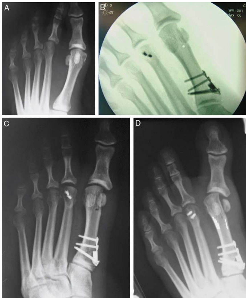
FIGURE 11. A, Preoperative radiograph. B, Postoperative fluoroscopy demonstrates good correction. C, Early follow-up with maintained alignment. D, Patient took off cam boot at 3 weeks postoperatively and felt a “pop” resulting in severe varus deformity.

osteotomy site (Fig. 5), or alternatively, autograft may be harvested from the calcaneus (Fig. 6).