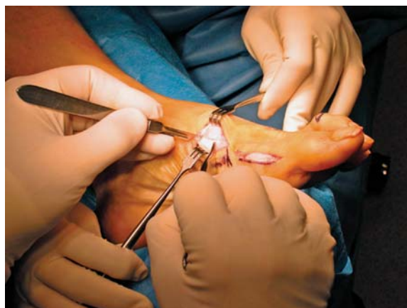
FIGURE 1. Percutaneous incisions over the medial eminence and dorsal medial base of the first metatarsal.

The indications for the use of the first metatarsal proximal opening wedge osteotomy are a hallux valgus deformity with a first-second intermetatarsal angle of 13 degrees or greater. Contraindications to this technique are first-ray hypermobility, an arthritic first tarsometatarsal (TMT) joint and painful hallux metatarsophalangeal (MTP) joint arthrosis. Relative