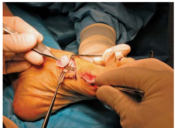
FIGURE 5. The medial eminence excised is usually sufficient bone graft for the osteotomy site.

The preoperative assessment of the patient presenting with hallux valgus begins with a careful history. Attention to the onset of deformity helps distinguish adolescent bunions, which may have a greater tendency toward recurrence. It is important to confirm with the patient that adequate conservative