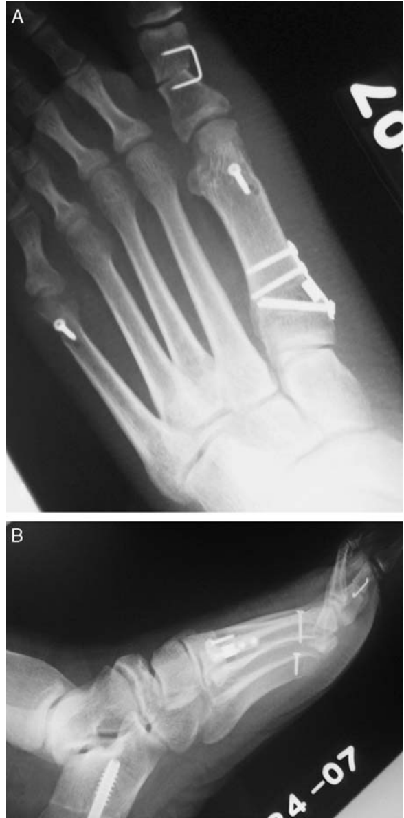
FIGURE 8. Radiograph shows a triple osteotomy for a juvenile hallux valgus deformity with associated plano-valgus correction.

treated with a Lapidus-type procedure. Patients will often present with nerve irritation along the course of the superficial cutaneous nerve because it courses over the medial eminence. This symptom typically improves with surgical correction of the bunion but should be noted preoperatively. Finally, lesser toe deformities are noted and discussed with the patient for possible correction.