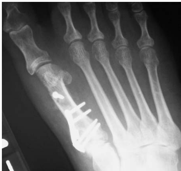
FIGURE 12. Double osteotomy of a severe hallux valgus deformity using a biplanar chevron osteotomy for correction of the DMAA and to obtain further correction of the deformity.

fixed, and Instron testing was performed to determine ultimate load to failure, stiffness, and load versus displacement. There were no cases of hardware failure in either group. At maximal load, the lateral cortex failed with the LPS construct, whereas 4 of 5 screws and Kirschner wires pulled out of the bone, and 1 metatarsal fractured in the chevron group. There was no significant difference in ultimate load to failure, stiffness, or in other measured parameter between osteotomy types.