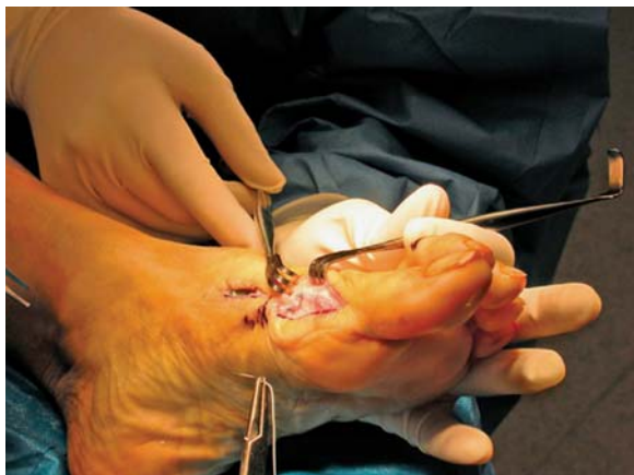
FIGURE 9. Capsular repair is shown using a nonabsorbable suture.

arthrosis. On the lateral radiograph, special attention to gapping of greater than 2 mm at the first TMT joint may indicate hypermobility.