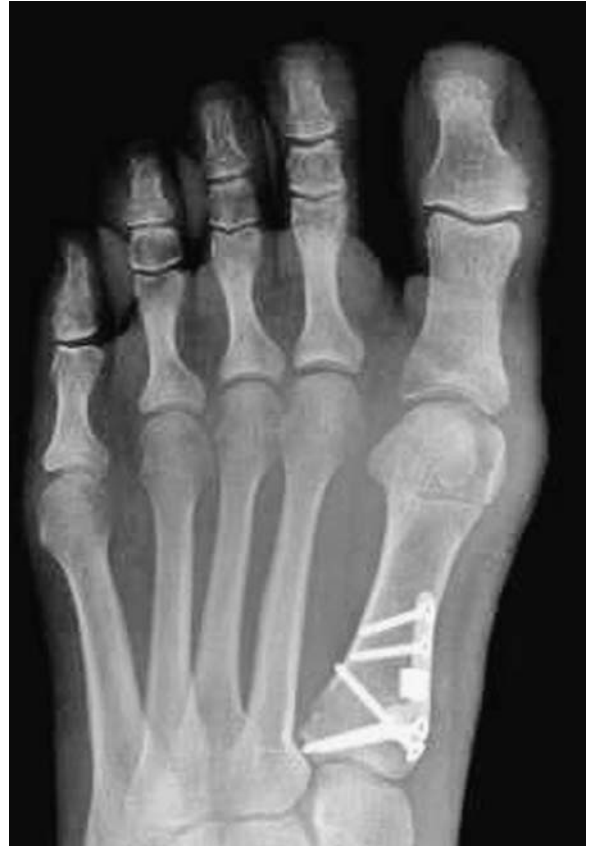
FIGURE 4. Radiograph showing placement of proximal screws in the proximal segment of the osteotomy and additional screw outside the plate for enhanced fixation of the apex of the osteotomy. The authors prefer to place the proximal screws across the apex of the osteotomy.