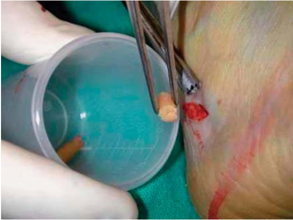
FIGURE 6. Alternative method using cancellous graft from the calcaneus for the osteotomy site.

measures have been trialed including wide toe-box shoes. Additionally, a patient being considered for surgical intervention should demonstrate pain over the medial eminence or lesser toe pathology as a result of the hallux valgus deformity. Scheduling patients for surgery strictly to correct cosmetic deformities is not recommended because this can lead to a painful condition postoperatively.