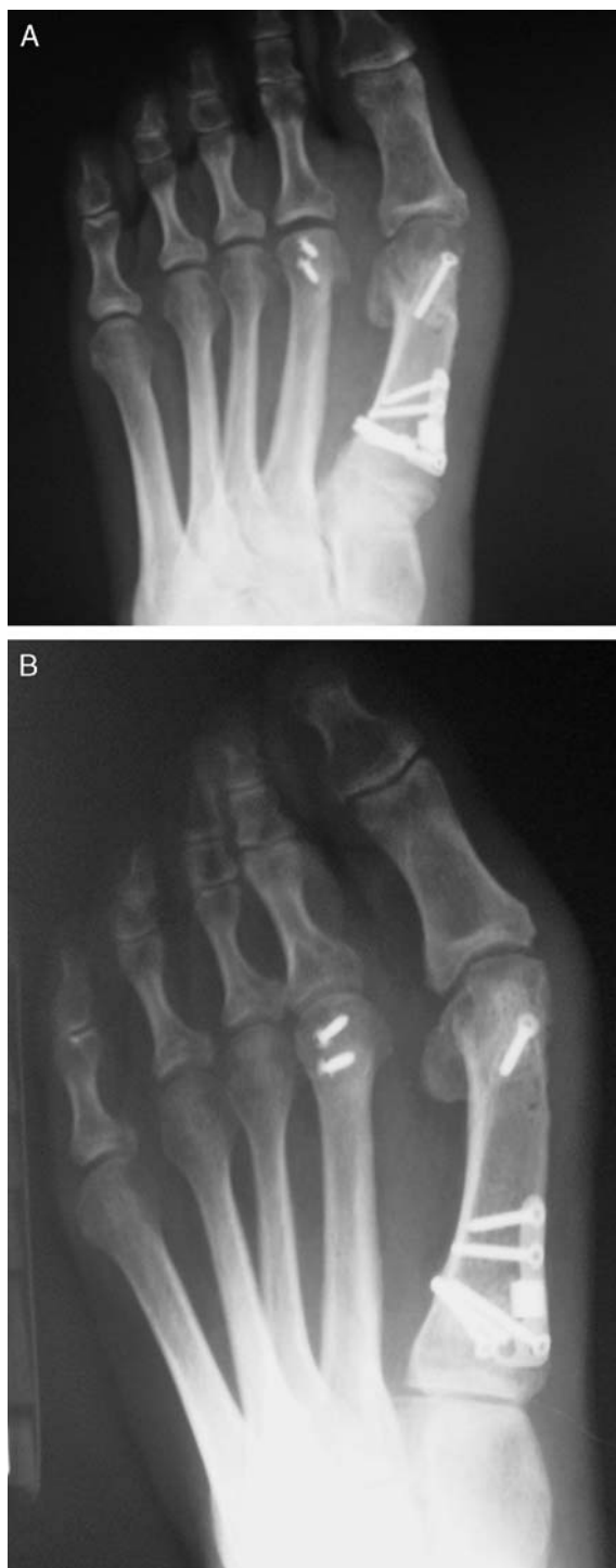
FIGURE 10. A, Early valgus drift due to poor capsular tissue in a patient undergoing chemotherapy for breast cancer. B, Continued valgus drift with no obvious change in the IMA, no loss of fixation and good bone healing. A drill hole was utilized for the capsule repair.

proximal metatarsal segment (Fig. 4). An oblique screw outside the plate may be used for additional fixation (Fig. 4). The autograft from the medial eminence is impacted into the